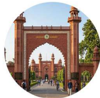
Molecular Diagnostics and Therapy – Aligarh (Coming Soon)