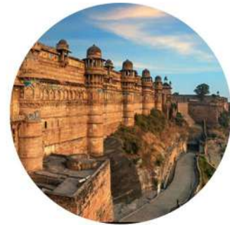
Building No. 1697, Sakhiya Villas, Opposite Jhansi Road Police Station, Jhansi Road, Lashkar, Gwalior Molecular Diagnostics and Therapy – Gwalior, Madhya Pradesh