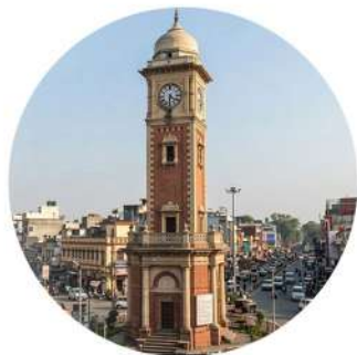
Building No. 23, Hari Govind Plaza, Saharanpur Road, Patel Nagar, Dehradun, Uttarakhand – 248001 Molecular Diagnostics and Therapy – Dehradun, Uttarakhand