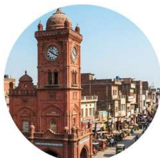
Molecular Diagnostics and Therapy – Meerut (Coming Soon)