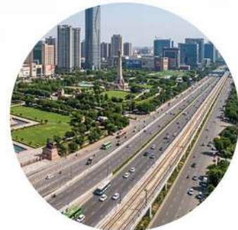
Basement, Opposite Metro Pillar No. 236 & 237, Hoshiarpur Village, Sector 51, Noida, Uttar Pradesh – 201301 Molecular Diagnostics and Therapy – Sector 51, Noida, Uttar Pradesh