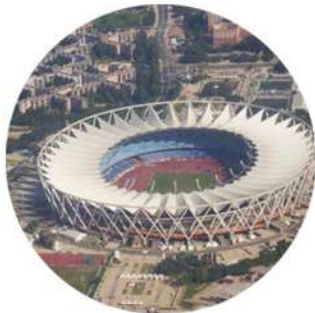
27, In front of Metro Pillar No. 196, Paschim Vihar Extension, Delhi – 110063 Molecular Diagnostics and Therapy – Paschim Vihar, Delhi