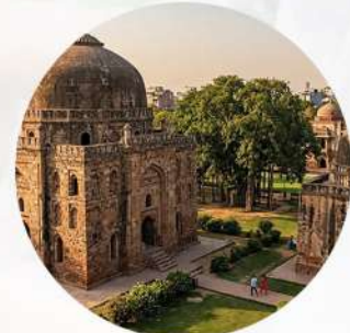
H-2, Basement Ground Floor, Ch. Hukum Chand Marg, Green Park Extension, New Delhi – 110016 Molecular Diagnostics and Therapy – Green Park, Delhi