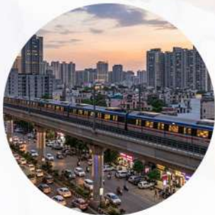
Plot No. 14,15, Sanjay Nagar, Sector 23, Ghaziabad, Uttar Pradesh – 201002 Molecular Diagnostics and Therapy – Ghaziabad, Uttar Pradesh